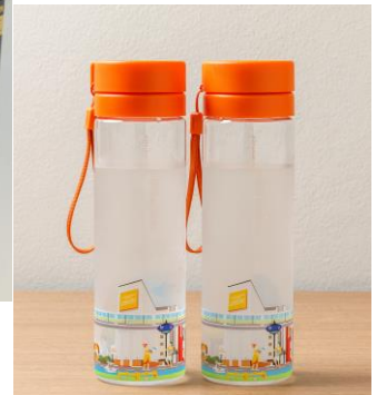
< Water Tumbler >

You may refill the water tumbler using the water dispensers located on each floor.