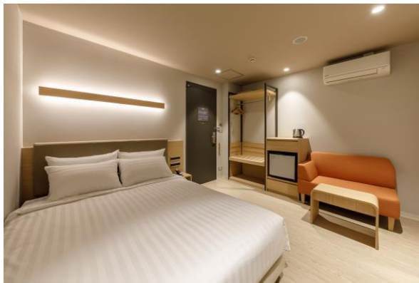
< Standard Double >