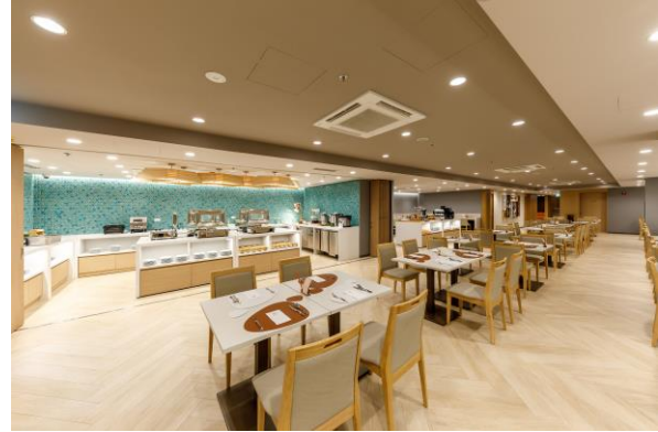
< Breakfast Restaurant > The restaurant area is available for use as a co-working space outside of breakfast hours.