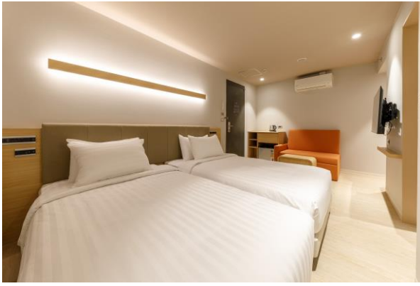
< Deluxe Twin >