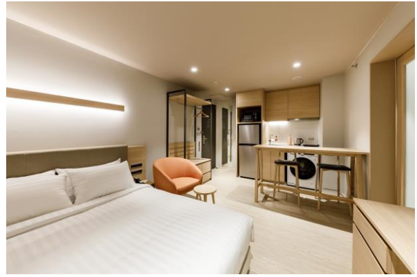
< Deluxe Stay >