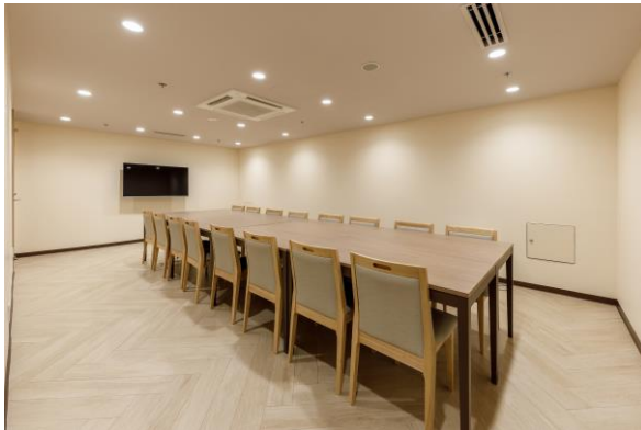
< Meeting room > The space is suitable for multi-purpose events and is equipped with a 55-inch television monitor.