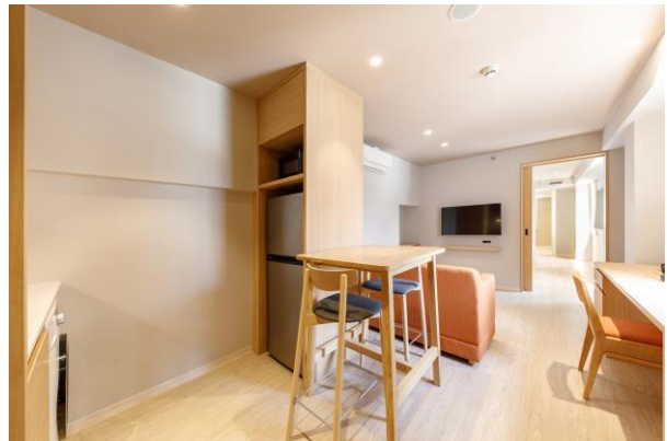
< Croom Stay Suite >