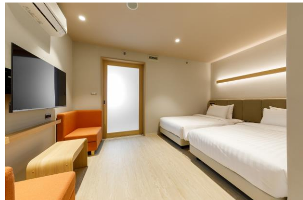
< Standard Twin >