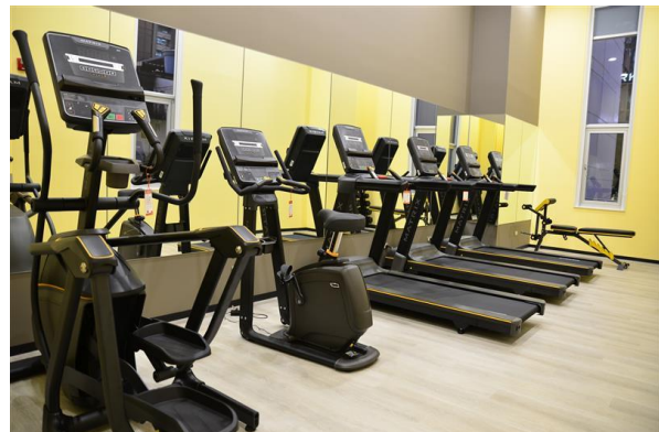
< Gym > Complimentary access is available throughout your stay.