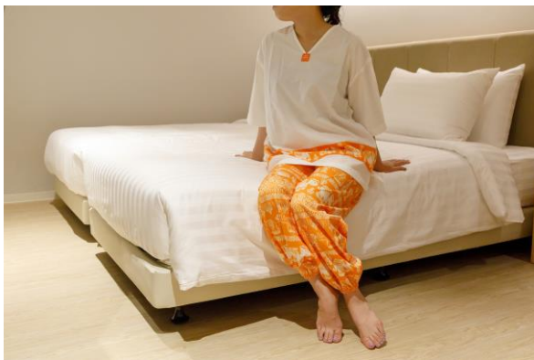
< Nightwear >

Thai nightwear provides a comfortable and relaxed experience